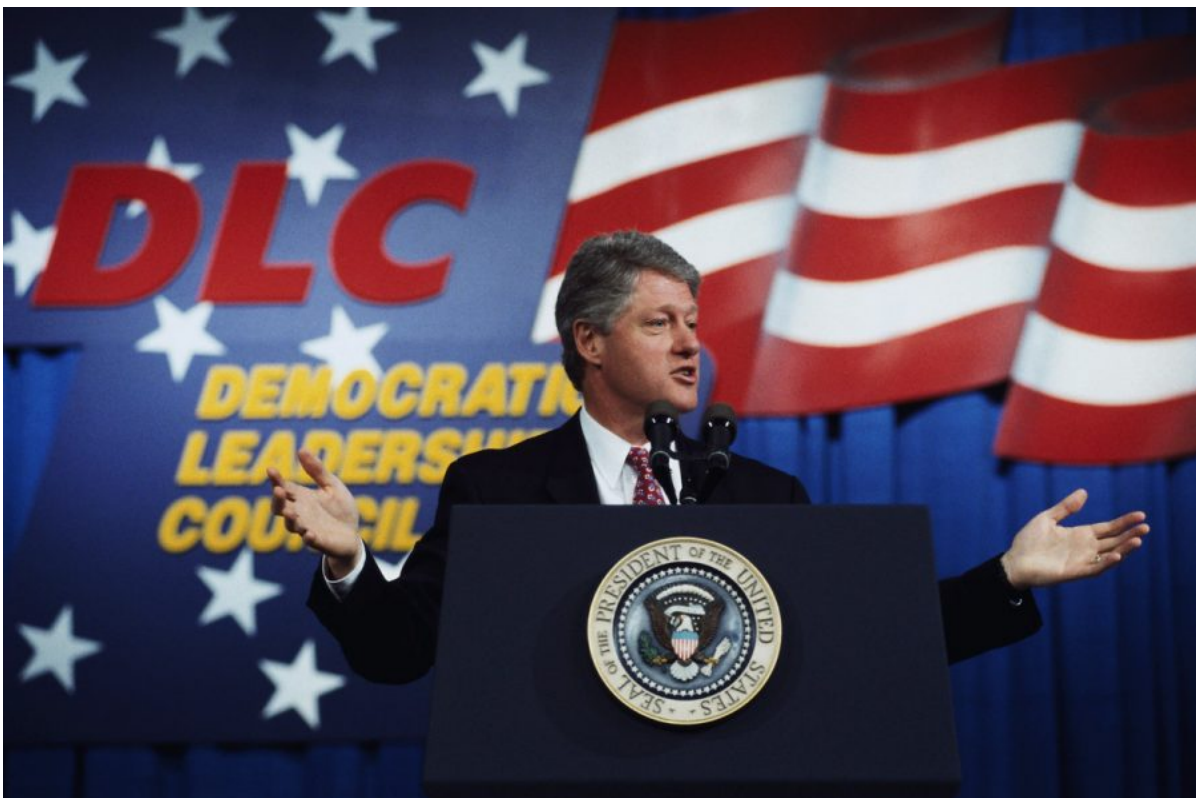
Bill Clinton speaks to the Democratic Leadership Council on December 3, 1993.

Both transformations can be read as driven partly by circumstances and partly by conscious effort applied to parties themselves. For example, the decline of manufacturing weakened the Democrats’ labor base as well as the economic base of the old WASPs in the Republican Party. Democrat support for civil rights drove Dixiecrats out, and Richard Nixon’s Southern strategy welcomed them into a Republican Party that had once been fairly progressive on civil rights.