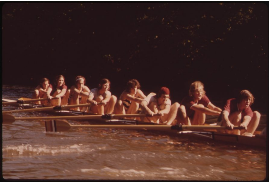
Visiting crew team at the Groton School on the Nashua River.

At the rank-and-file level, men worked in genteel law firms and brokerages or as executives in old-line manufacturing firms, and women did volunteer work for museums and charities and maintained the social relations that kept the group functioning together as a class. At the high end, WASPs played a role in government far out of proportion to their numbers, most notably in foreign policy. The Council on Foreign Relations (CFR), target of innumerable conspiracy theories generated from left and right for its prominent role in shaping imperial policy, traces its origins to the end of World War I, when a delegation of British and American diplomats and scholars decided to preserve the transatlantic comity of the war years and form a council whose purpose was, in the words of Peter Gosse's official history, "to convene dinner meetings, to make contact with distinguished foreign visitors under conditions congenial to future commerce." The CFR didn't begin to influence policy until the 1930s, when its fellows and members helped plot the takeover of the British Empire, a concern of the Franklin Roosevelt administration.