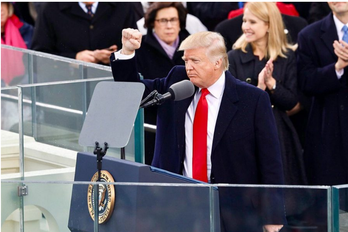
Donald Trump at his inauguration on January 20, 2017.