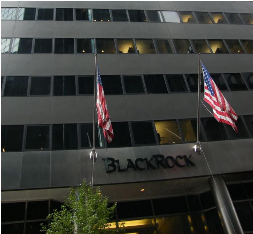
BlackRock building in New York.

an index fund is almost automatic, fees are very low compared to actively managed funds, which require the attention of highly paid specialists (who rarely deserve their compensation given how many of them lag the averages they're supposed to beat).