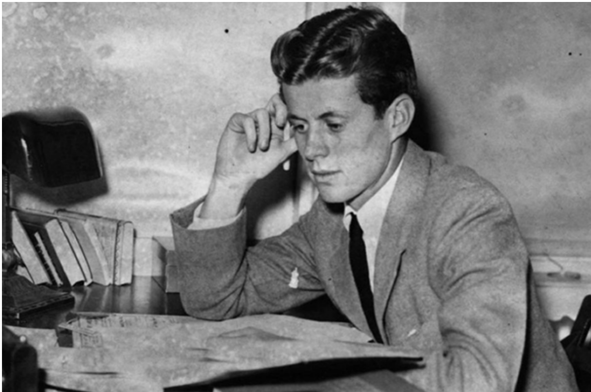
John F. Kennedy at Harvard University, circa 1939.

Cast into political exile in the Eisenhower years, the WASPs returned with the status-anxious John F. Kennedy, desperate for the approval of a stratum suspicious of Irish Catholics. Kennedy, who was denounced by WASP columnist Lucius Beebe as "a rich mick from the Boston lace curtain district," went to Choate and Harvard to learn the manner of the upper orders. As president, he brought back the older patrician crew and added the notorious McGeorge Bundy, another Groton product, who would be one of the most enthusiastic promoters of the Vietnam War, a disaster that pretty much ended that caste's dominance of foreign policy.