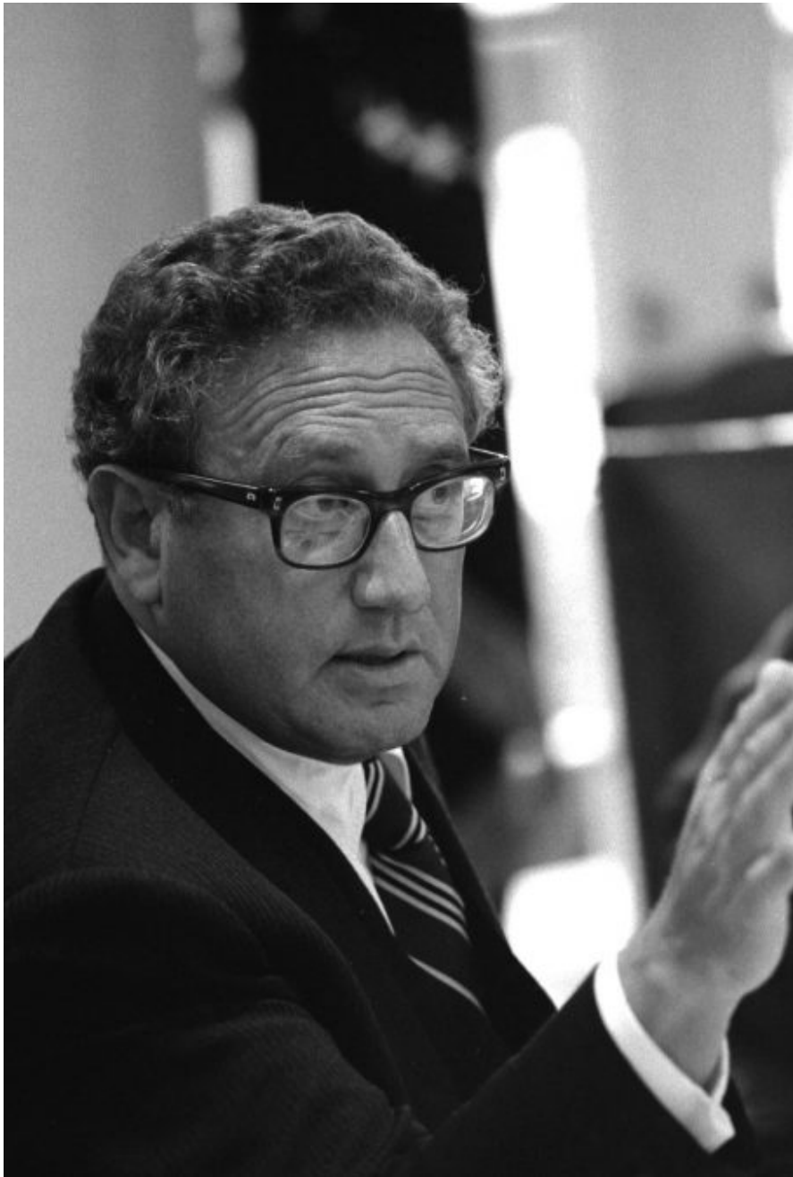
Secretary of State Henry Kissinger in 1976.

Before proceeding, I should say I'm not taking seriously the idea that there is no ruling class — that there are voters in a democracy who may be divided into interest groups but none are dominant. Yes, the constrained democracy we live under is a lot better than a dictatorship would be; elections do act as a limit on elite power. But that's a long way from the popular self-government socialists dream of. Nor am I taking seriously conceptions of a ruling class that center on PC-obsessed, organic-food-eating urban elites. That set has some influence, especially among the liberal wing of the consciousness industry, but it doesn't shape the political economy.