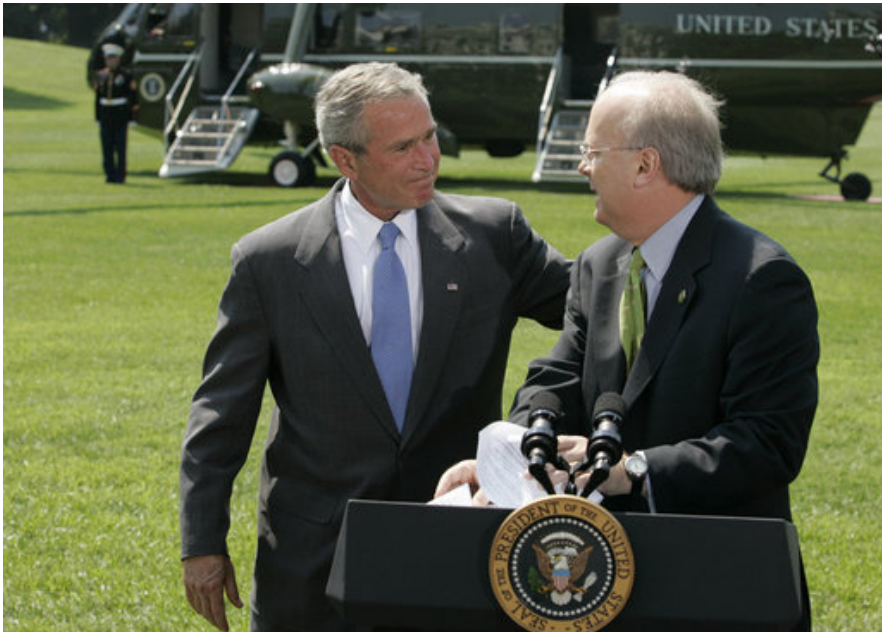
President George W. Bush and Karl Rove on August 13, 2007.

After that bubble burst, creating the financial crisis and the Great Recession, the smooth and cerebral Barack Obama seemed like a stabilizing force. That's not what many of his more fervent supporters expected of his presidency; they were hoping for a more peaceful and egalitarian world, but they got neither. Facing the greatest economic crisis since the 1930s, one like that depression driven in large part by Wall Street, Obama was not about to do anything on the scale of the New Deal. There was the early and underpowered stimulus package, but beyond that, there would be no major reregulation of finance and no programs of public investment, income security, or redistribution. Unlike the Franklin Roosevelt administration, or even John F. Kennedy's, for that matter, there was little political ferment around the White House, even though the Democratic policy elites came out of the same Ivy League circles as their ancestors.