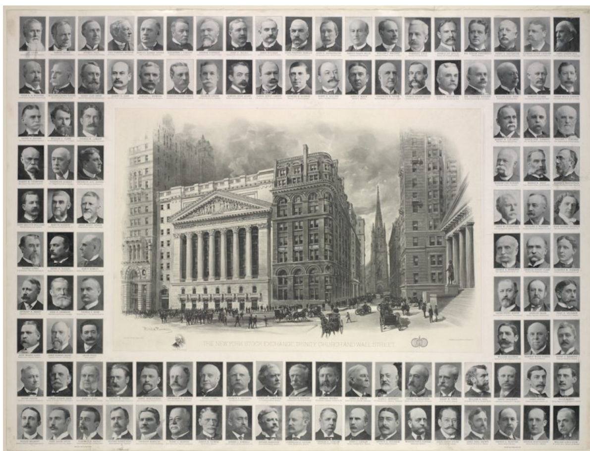
The New York Stock Exchange and portraits of capitalists and financiers, 1903.

For the first few postwar decades, the New Deal model was standard liberal doctrine. In The New Industrial State , John Kenneth Galbraith argued that rapacious profit maximization had been replaced by a secure mediocrity, and greedy capitalists by a “technostructure.” Top managers, who were well paid but on nothing like today’s scale, saw little point in risk-taking; they wanted sales growth and prestige, not the paychecks that would later populate the Forbes 400. Today’s paychecks are driven by stock prices; in the 1950s, top executives were paid mostly straight salaries. Shareholders had become vestigial; if they didn’t like the performance of firms they held stock in, they’d just sell the shares. No one ever troubled management.