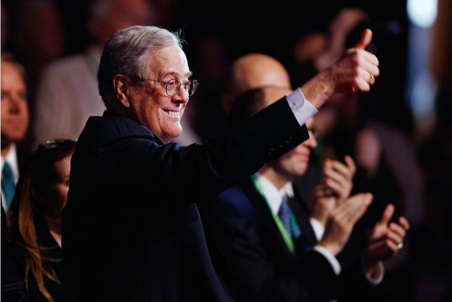
David Koch on November 4, 2011 in Washington, DC.

Most of the organizational energy ever since has been on the Right. The most prominent figure in that agitation for decades has been Charles Koch, a rare case of a serious capitalist organizing independently on his class's behalf. Along with his late brother David, Charles has led a small but very rich network of plutocrats who have pushed American politics to the right at every level of government over the last few years. The family's money comes from control of a private company, Koch Enterprises, with $115 billion in annual revenues. Were it a public corporation, it would rank around seventeenth in the Fortune 500.