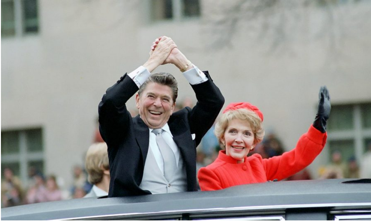
President Ronald Reagan and Nancy Reagan waving from the limousine during the Inaugural Parade on January 20, 1981, in Washington, DC.